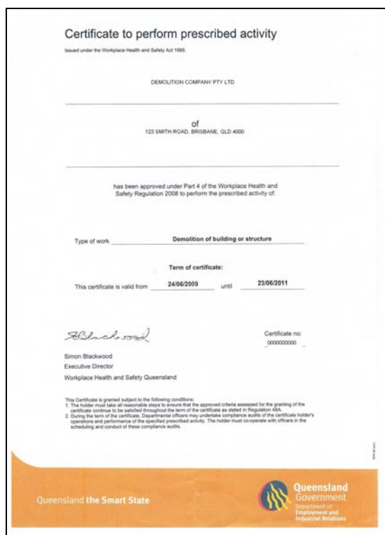
Example of new certificate

The certificates are now issued to the business undertaking the demolition work. The business holding either of these certificates must ensure demolition work is directly supervised by a competent person.